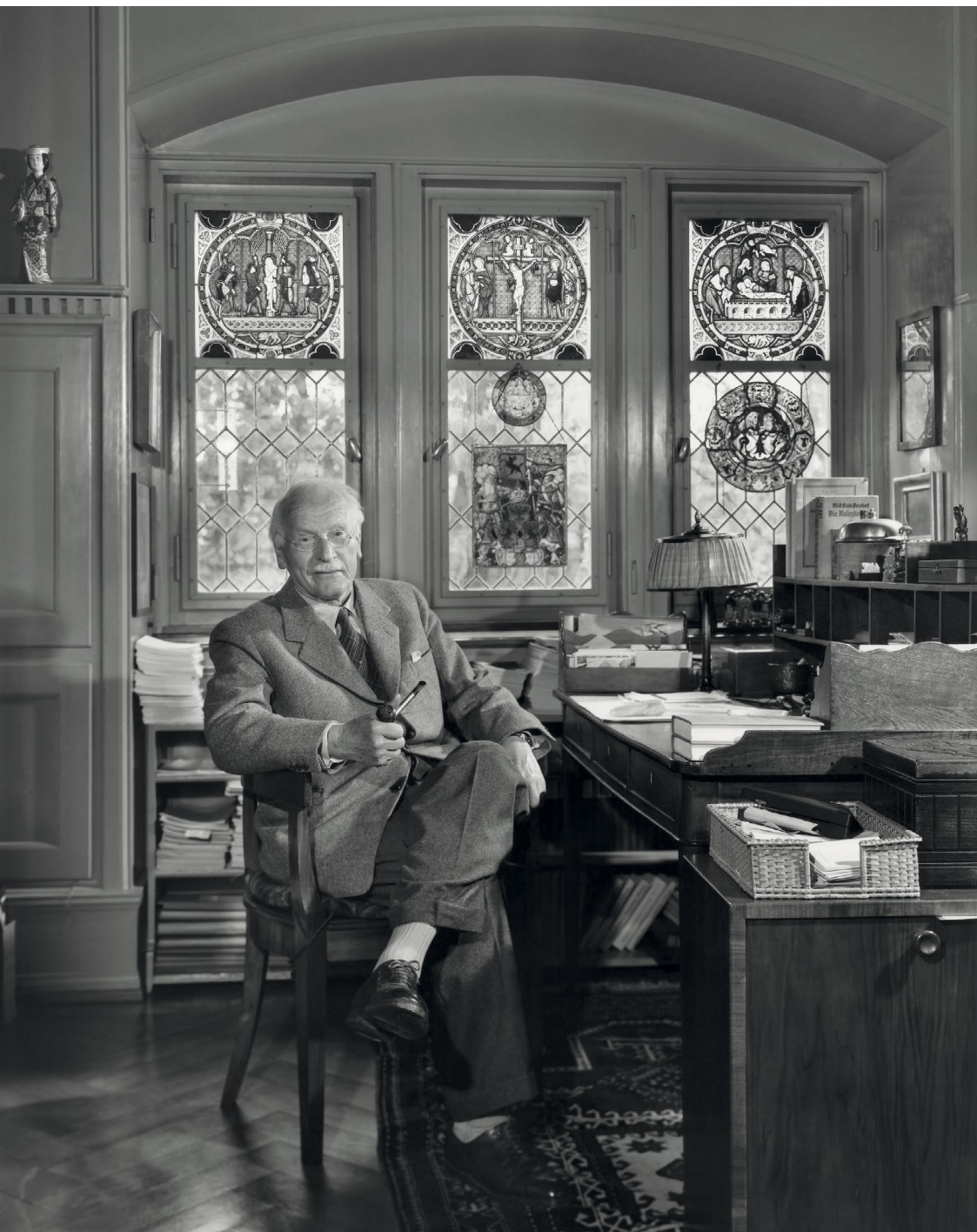
Carl Gustav Jung, 1958