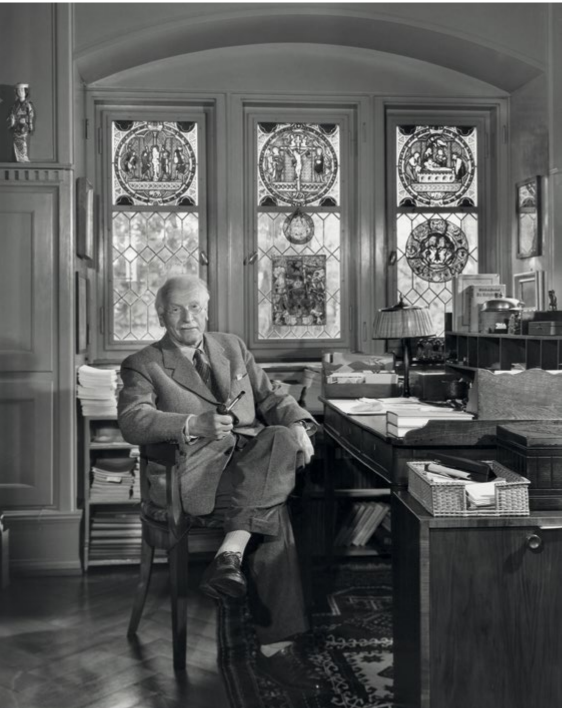
Carl Gustav Jung, 1958